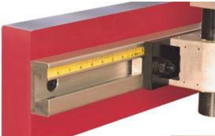
Direct Mount Rail